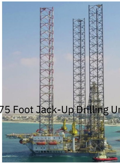
375 Foot Jack-Up Drilling Unit